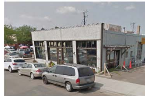
5. Adjacent Building