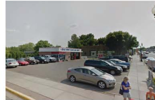
8. Building Across Street