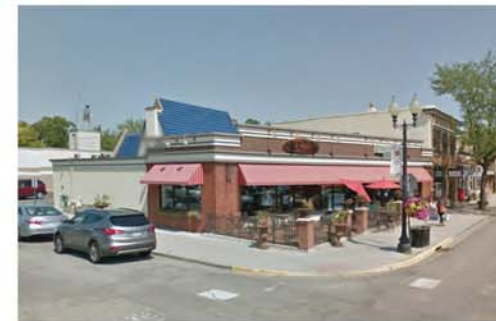
6. Building Across Street