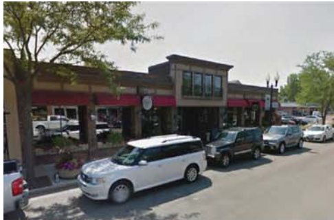
1. Adjacent Building