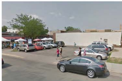
4. Proposed Site (SW View)