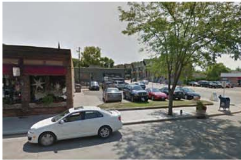
2. Proposed Site (NW View)