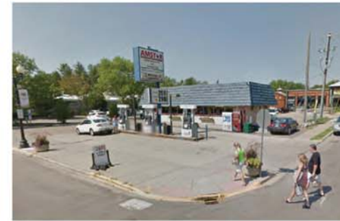
7. Building Across Intersection