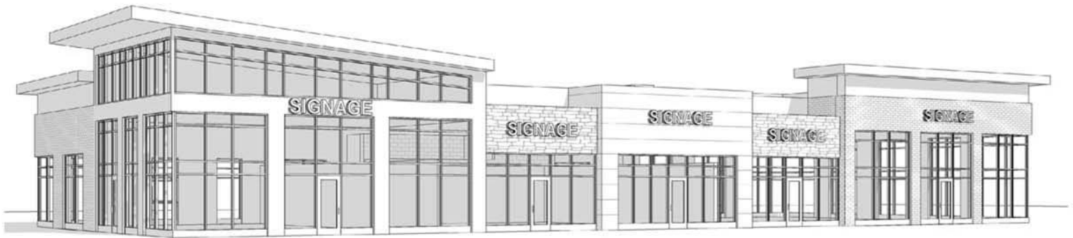
A3 3D View 1

Information has been obtained from the property owner or other sources that we deem reliable. Although we have no reason to doubt its accuracy or completeness, no representation or warranty is made regarding the information and the property is offered "as is". This submission may be modified or withdrawn at any time by the property owner.