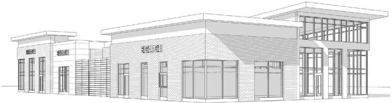
A4 3D View 3